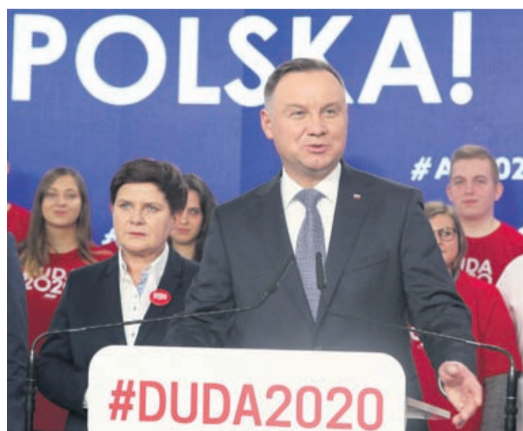
In this Feb. 19, 2020 file photo, Poland's President Andrzej Duda campaigns for his re-election in Warsaw, Poland.